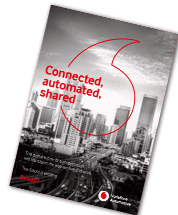
Connected, Automated, Shared