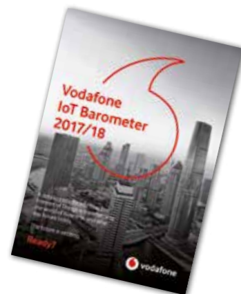
Vodafone IoT Barometer 2016